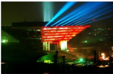
China's World Expo Pavilion

The tour will include educational presentations by members of the CH-ina team in conjunction with other local experts. Additionally, the program will expose guests to the sights sounds and tastes that make China, and Shanghai in particular, one of the most dynamic locations on earth.