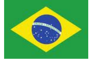
Federative Republic of Brazil