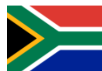
Republic of South Africa