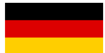
Federative Republic of Germany